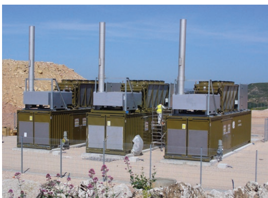
Arbois, France, 3 x JGC420