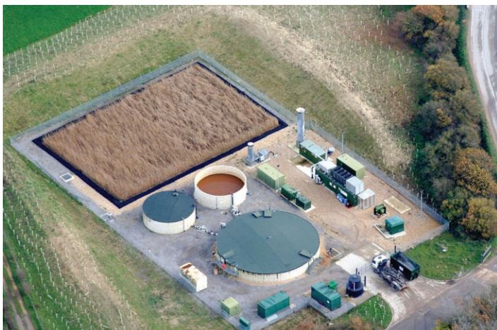
Lymington Landfill, Vindor, UK, 1 x JGC420